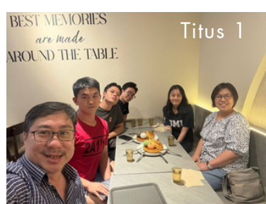
BEST MEMORIES are made AROUND THE TABLE Titus 1