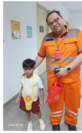
Galaxy A73 5G