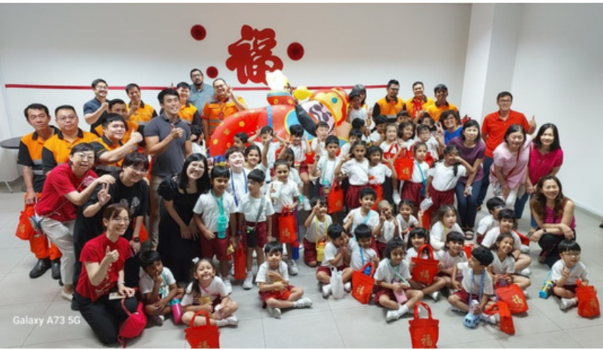
Galaxy A73 5G